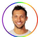
Ian Thorpe 5 x Gold Medallist, Multiple World Record Holder, LGBTIQ+ Champion, Olympic Commentator and National Hero

In this session, Olympic legend Ian Thorpe will discuss his journey through the highs of his athletic achievements and the personal challenges of addressing his sexuality. He will share insights into the pressures of life under public scrutiny and the liberation that came with embracing his true self after retiring from competitive swimming.