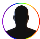
YOUR SPEAKER WILL BE ANNOUNCED SOON