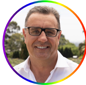
TIM FORD CEO Treasury Wine Estates