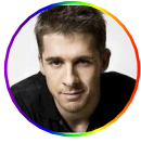
HUGH SHERIDAN Acclaimed Actor and Advocate for Inclusivity Packed to the Rafters

As a celebrated actor and public figure, Hugh will share his experiences navigating the intense pressures of fame and the challenges of maintaining a private life under public scrutiny. Delve into his journey as a leading man, the expectations placed upon him, and how he balances his public persona with his personal identity. Gain valuable insights into the realities of fame, the impact on mental health, and strategies for resilience.