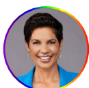
Narelda Jacobs OAM Whadjuk Noongar Australian Journalist, Newsreader, & Television Legend; First openly lesbian TV newsreader